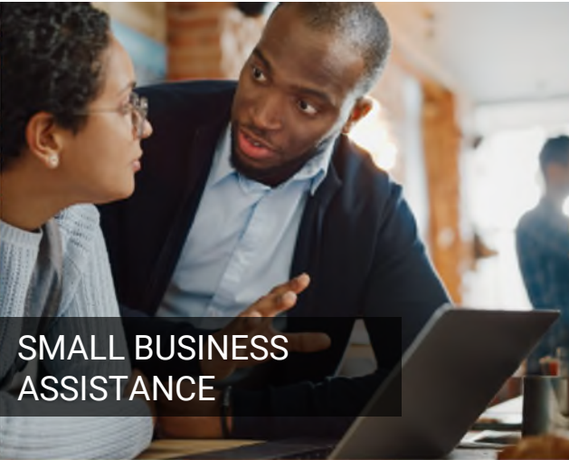
SMALL BUSINESS ASSISTANCE