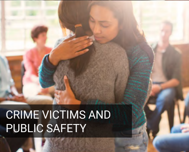
CRIME VICTIMS AND PUBLIC SAFETY