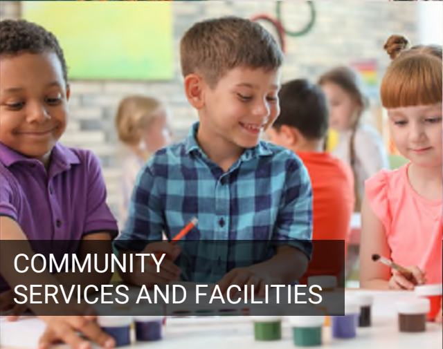
COMMUNITY SERVICES AND FACILITIES