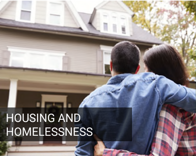
HOUSING AND HOMELESSNESS