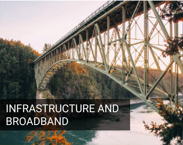
INFRASTRUCTURE AND BROADBAND