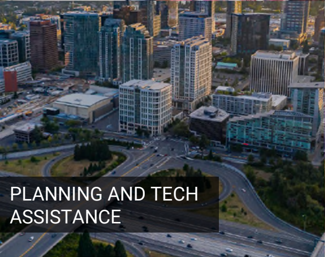
PLANNING AND TECH ASSISTANCE