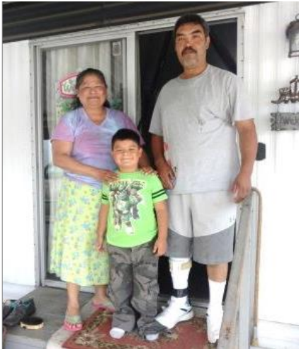
The Garzes-Lemus family with grandchild